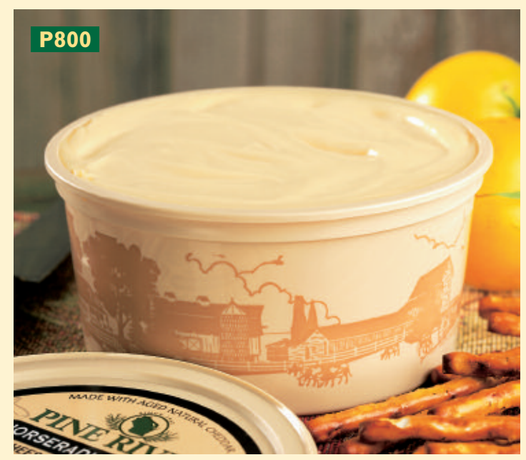
HORSERADISH GOURMET CHEESE SPREAD

P800. Vibrant white Cheddar spread flavored with a touch of zesty horseradish. (12 oz.) $13