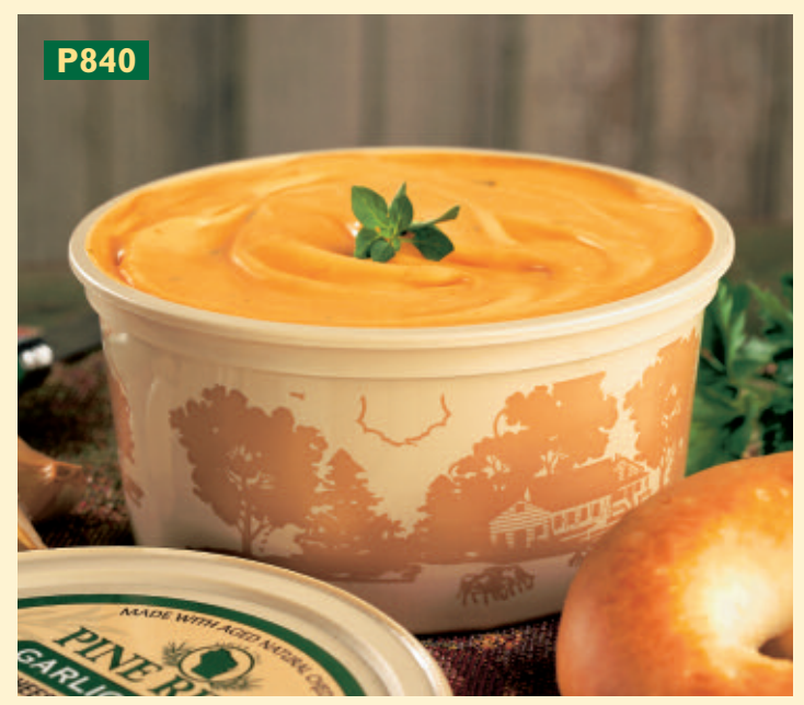
GARLIC & HERB GOURMET CHEESE SPREAD

P800. Vibrant white Cheddar spread flavored with a touch of zesty horseradish. (12 oz.) $13