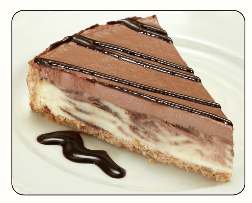
B) Chocolate Silk Cheesecake-32oz Tarta de queso de chocolate de seda

Creamy Cheesecake blended with chocolate and finished with chocolate sour cream.