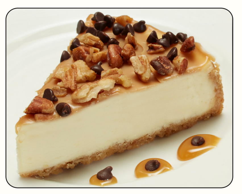
D) Turtle Cheesecake-32oz Pastel de queso de tortuga

Our Turtle cheesecake is smothered in caramel and topped with crushed nuts and chocolate chips.