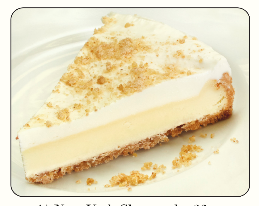
A) New York Cheesecake-32oz Pastel de queso de New York Our classic creamy New York Cheesecake nestled in a graham crust. Serve plain or finish off with your favorite topping.