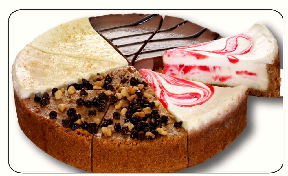
F) Sampler Cheesecake-32oz Pastel de queso surtido

Creamy Cheesecake blended with chocolate and finished with chocolate sour cream.