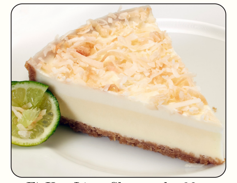
E) Key Lime Cheesecake-32oz Pastel de queso de limon Cool and refreshing Key Lime Cheesecake topped with a refreshing sour cream topping, and a toasted coconut garnish.